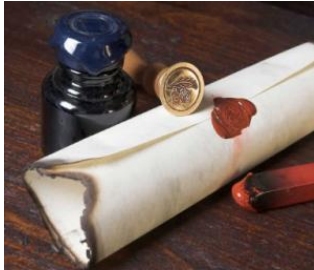
FOOD INVESTIGATION, VOLUME 4